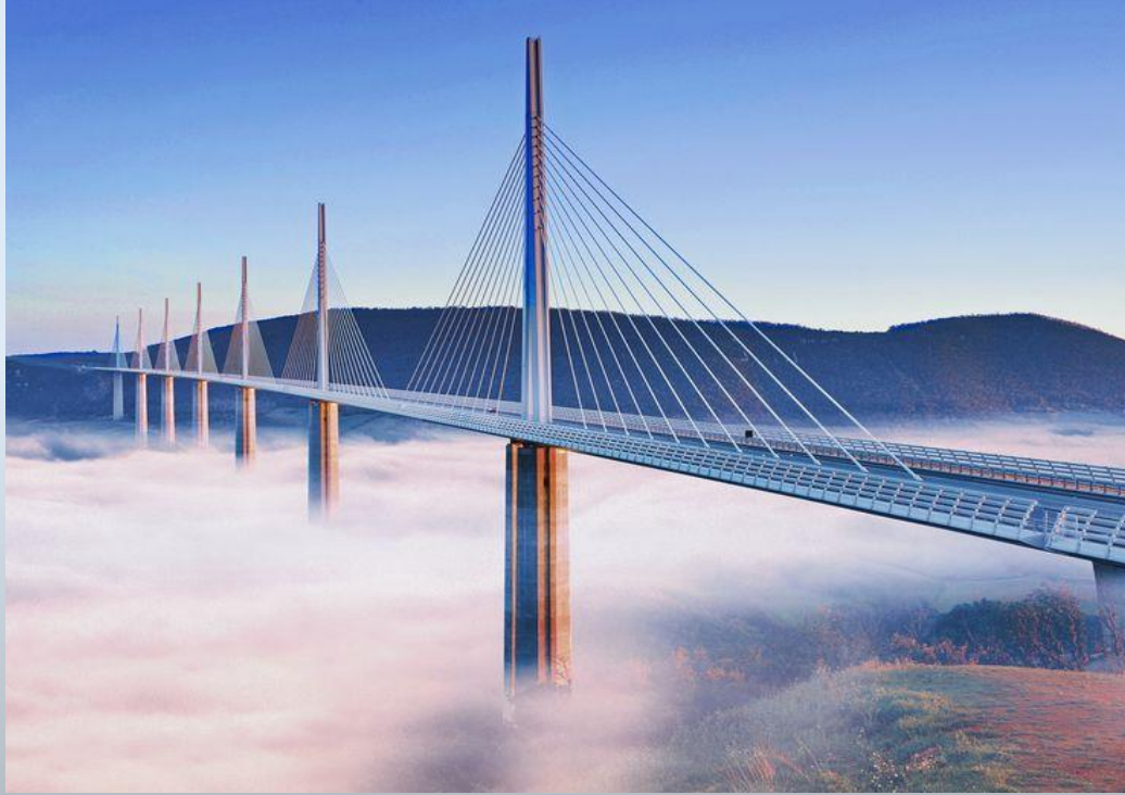
Millau Viaduct, France