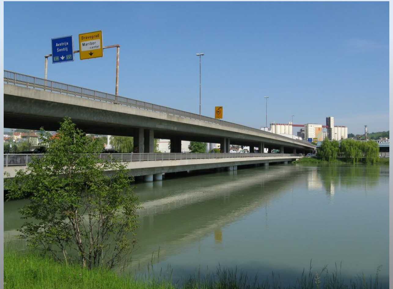
Two- story bridge in Maribor