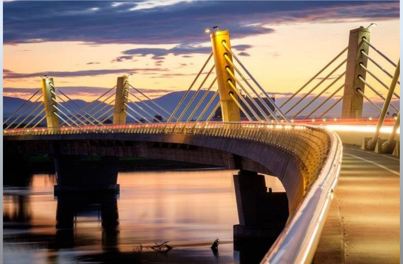
Puh bridge Ptuj