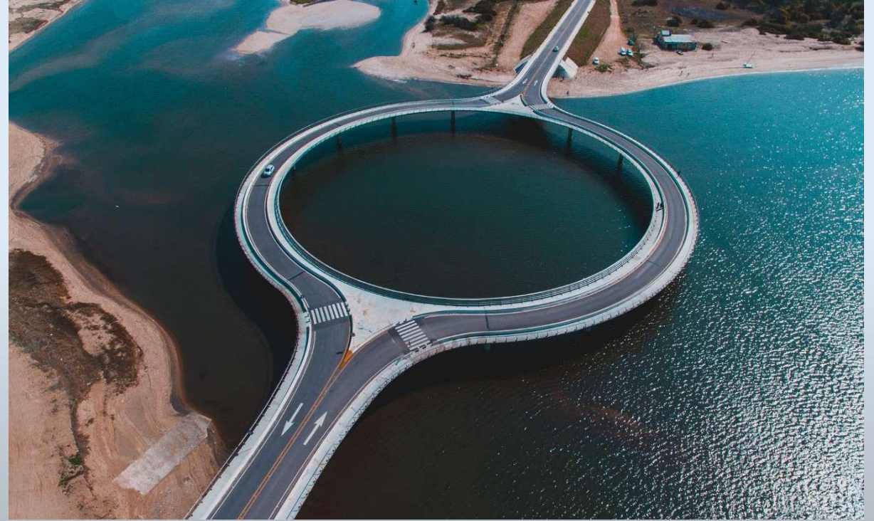
Laguna Garzon bridge, Uruguay