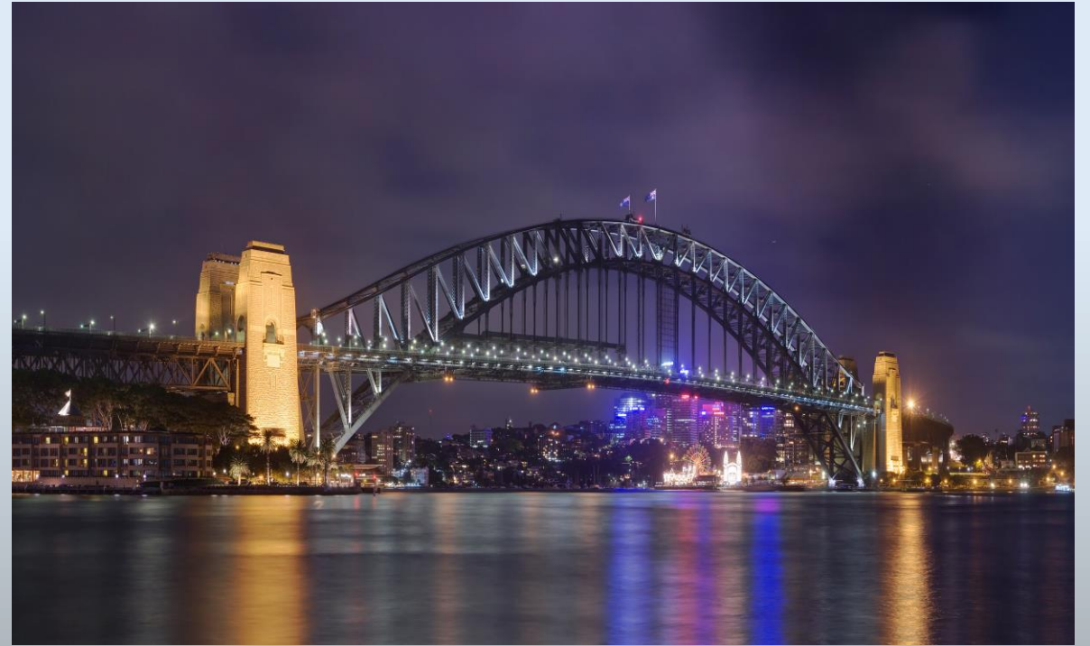
Harbour bridge, Sydney