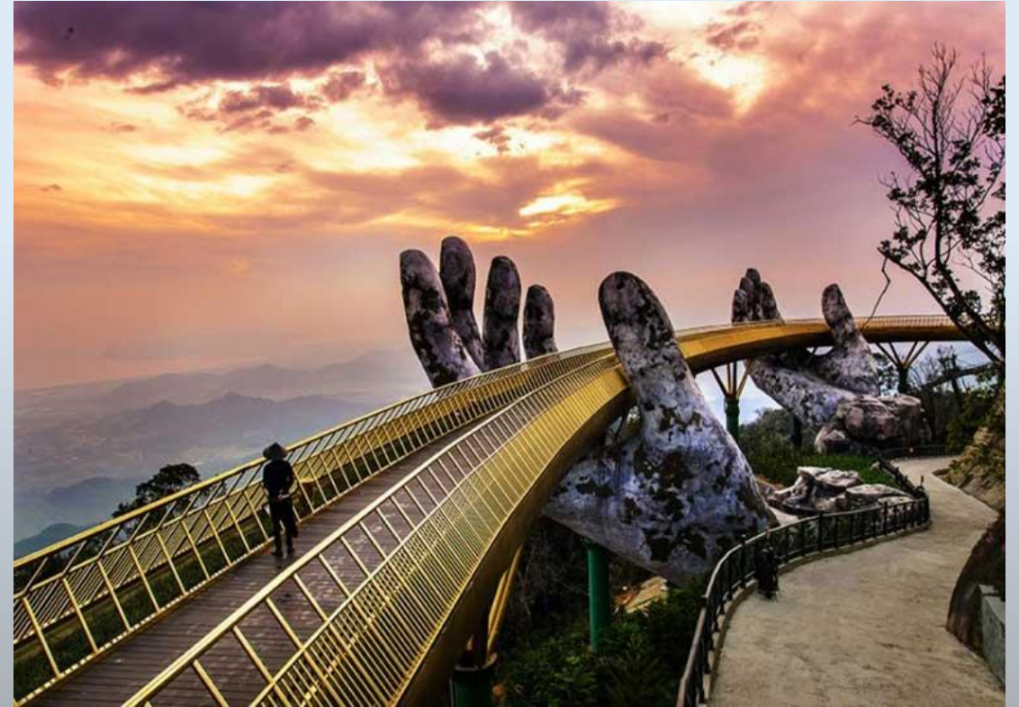
Golden bridge, Vietnam