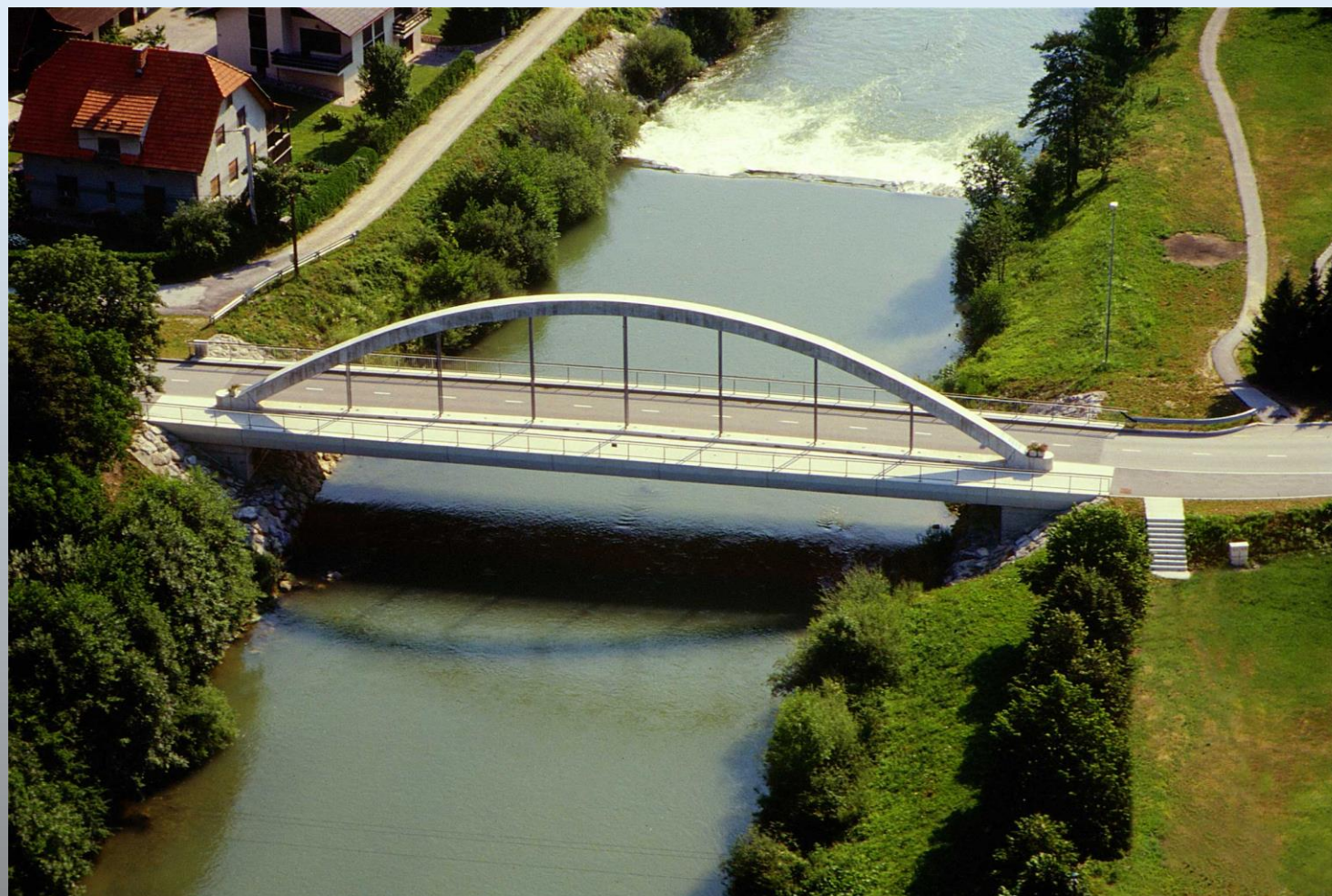
Most čez Savinjo, Mozirje