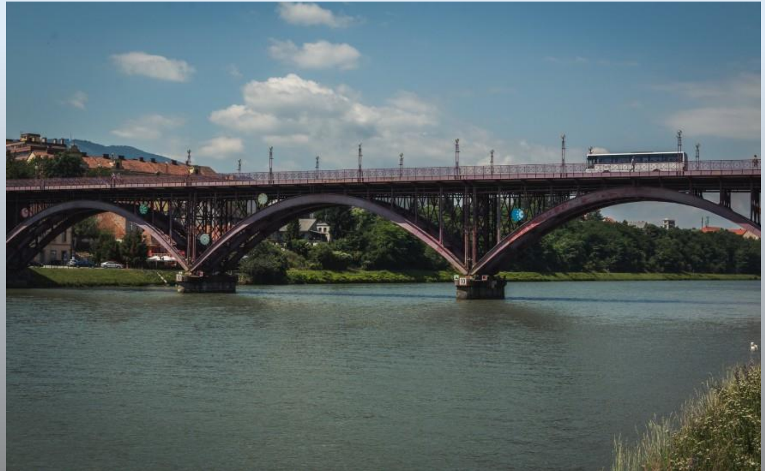
Old bridge Maribor