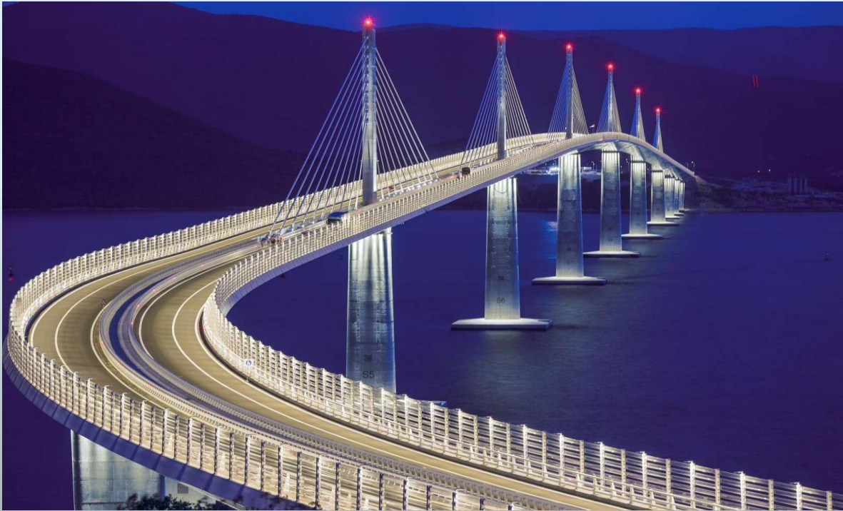
Pelješac bridge, Croatia