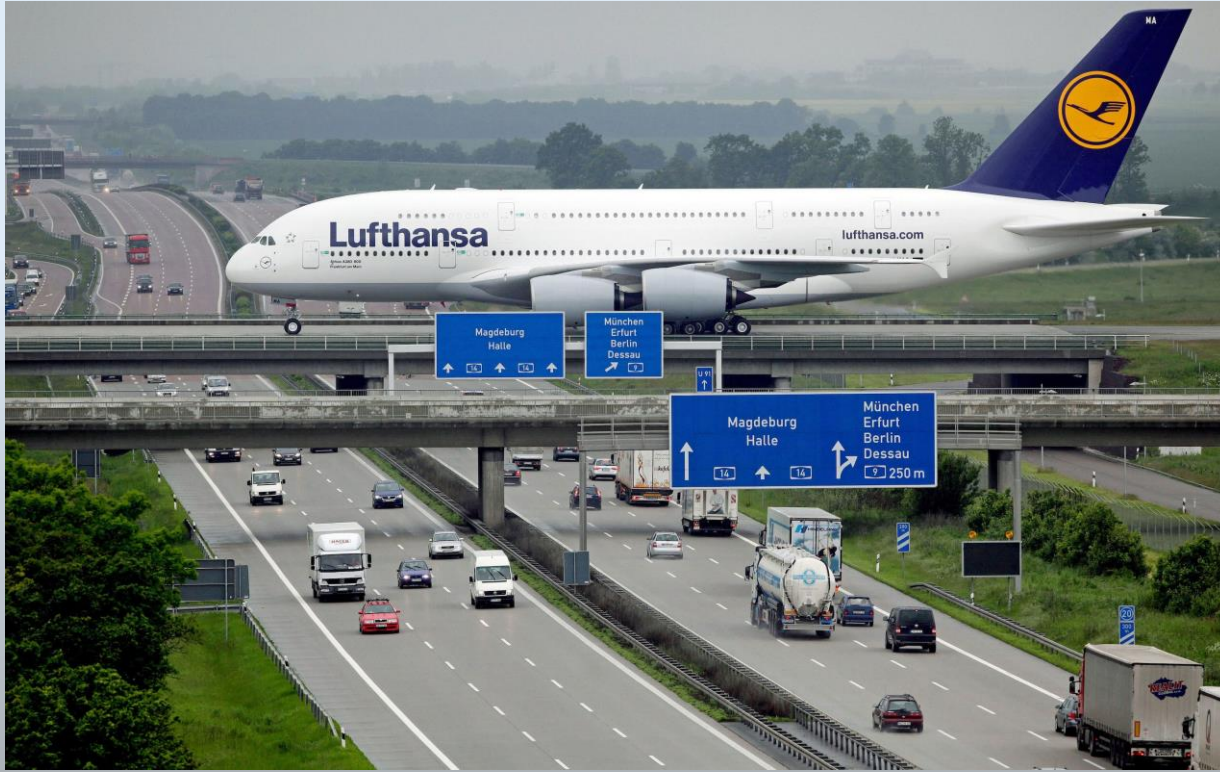
Overpass for planes, Leipzig